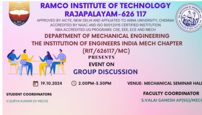
Fig. 1 Poster

Photographs with caption: (Activity reports not supported by photographs shall not be considered for award )