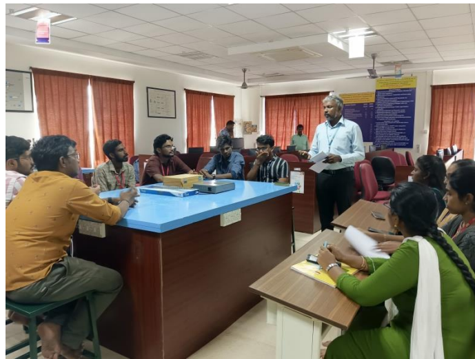
Fig. 2 Glimpses