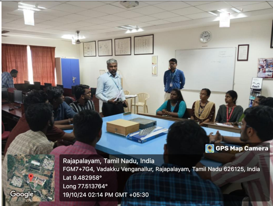
Fig. 3 Glimpses